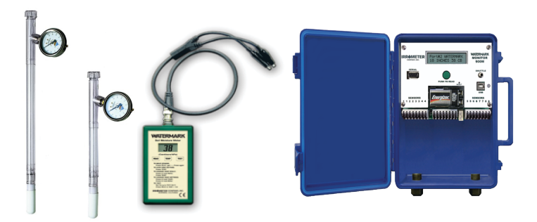
Figure 1: Tensiometers with gauges, a handheld meter, and a datalogger

Measuring soil water availability can help improve crop yields, conserve water, and improve water-use efficiency. Soil-water information can be retrieved in several ways, either on site or from a cloud-based system. Data can be retrieved in the field using a pressure gauge attached to a tensiometer. Alternatively, you can use a portable handheld reader or a stationary data logger, both of which can be connected to granular matrix sensors (see Figure 1). Data can also be collected via cellular or wireless systems, which allow for automated, remote data access.